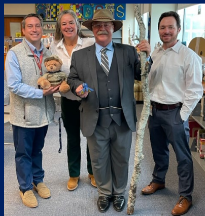
▲ Teddy Roosevelt repressor