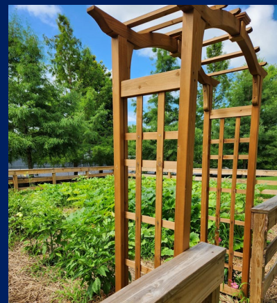
Vegetable garden supplies ▲