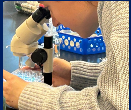
▲ Science Dept. microscopes