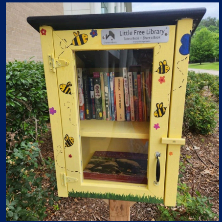
Little Free Library ▲