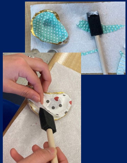
AP Language Independent Book Project ▼